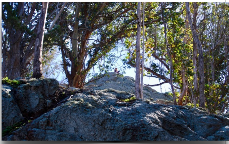
Looking back toward the top.